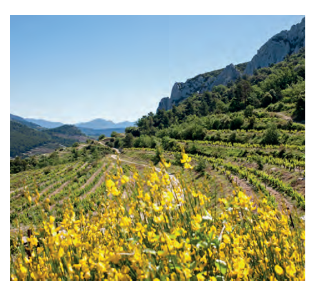
Vines at Domaine Les Florets

Domaine Les Florets lies at the foot of the rocky Dentelles de Montmirail. Its vineyards extend over 4 hectares of steep terrain in the Gigondas appellation, which were revived in 2007 by new owners, seeing the potential in the northeast facing terraces. Most Gigondas is made from low lying vineyards, but we are very much in the mountains at Les Florets, the vines reaching up to 500 metres above sea level. With summer temperatures rising, such cooler, higheraltitude locations are becoming greatly sought-after, as the grapes can ripen at a gentler pace, and it is easier to retain precious natural freshness. Ownership of the Domaine changed in January 2021 with the arrival of Jérôme Rathle, who has long experience in sustainable development and environmental protection. He is applying these principles in the viticulture and winemaking here, with the estate now in organic conversion. Oenologist Olivier Roustang works alongside him as a consultant winemaker.